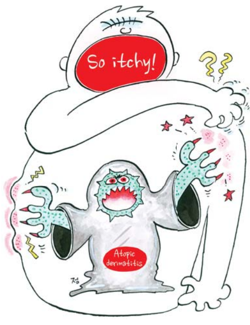
Most atopic patients have experience scratching until bleeding and describe the itchiness as torture.