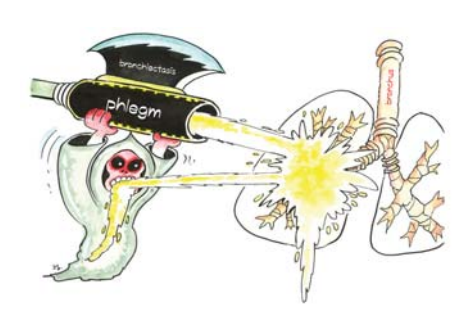
[Bronchiectasis] Phlegm generates in the expanded bronchi and causes difficulty in breathing

For a better understanding of emphyse-a and bronchiectasis, take a look at the illustrations to learn about their etiopatho-genic mechanisms.